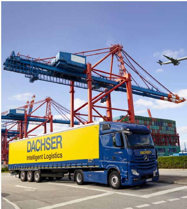
Dachser is one of the global leaders in system logistics. Dachser Air & Sea Logistics operates in global markets, providing air and sea freight services.

When a logistics company makes more than 78 million shipments a year, weighing in at more than 37 million tons, it is very much a global corporate powerhouse. Germany's Dachser Group is just that – and all under the ownership of the descendants of the founder, Thomas Dachser. Set up in 1930 in the southern German town of Kempten, where it is still headquartered today, Dachser is big. The company employs more than 26,500 people at 428 locations worldwide. It has offices in 43 countries and, in 2015, it had revenues of €5.6 billion.