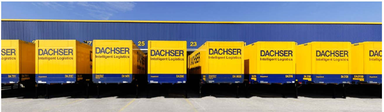
Dachser employs around 26,500 staff at 428 locations worldwide and is represented by subsidiaries in 43 countries.